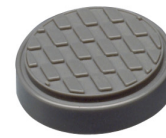
Gentle Body Massage